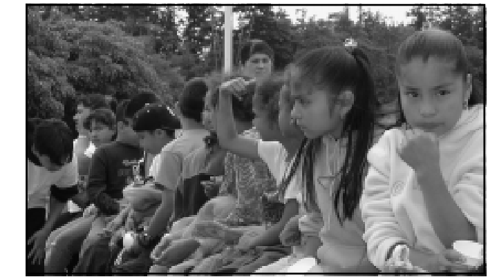
We offer free lunch to children in 3 apartment complexes four days a week

At New Futures, our crucial summer program inspired at-risk children to create, think, play, and dream.