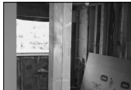
Construction began at our fourth site at the Cones Apartments in White Center! Look for a special Cones edition of New Times coming soon.